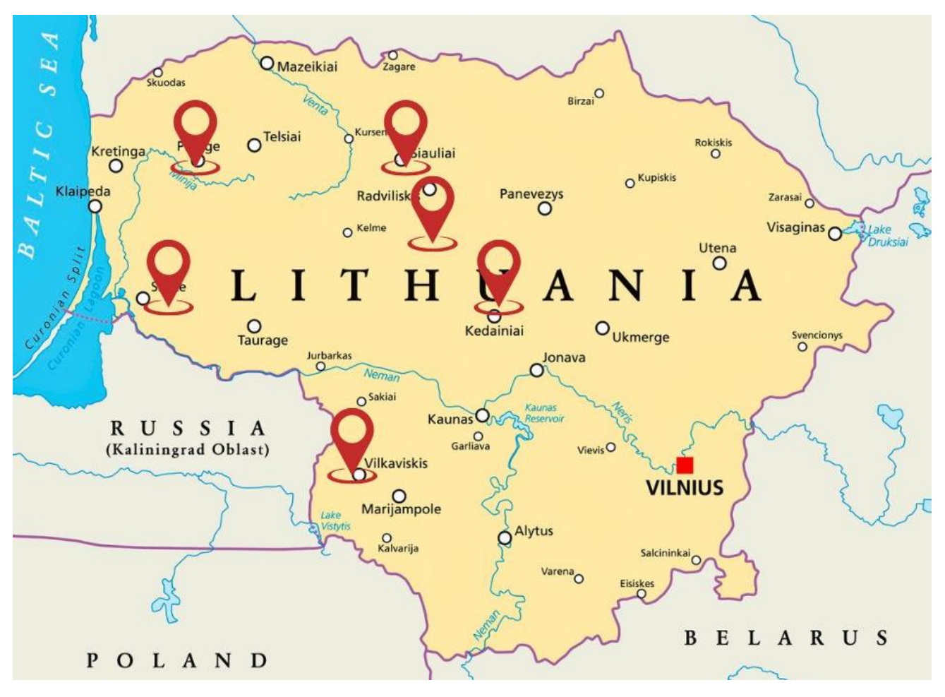
Figure 30. Location of the 6 pilot farms in Lithuania.

The six pilot farms are spread over Lithuania and are depicted in Figure 30.